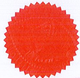
ASSISTANT CITY SOLICITOR

GIVEN under the Common Seal of the Council of the City of Liverpool this 25 th day of November 2014.