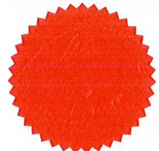
ASSISTANT CITY SOLICITOR

GIVEN under the Common Seal of the Council of the City of Liverpool this 5 th day of August 2014.