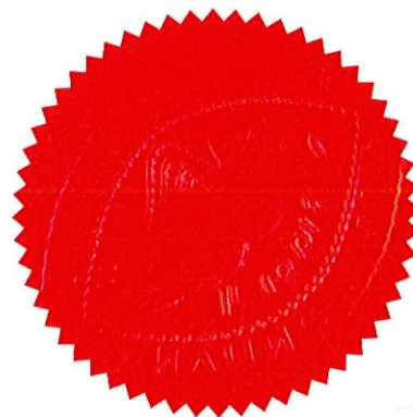
ASSISTANT CITY SOLICITOR

GIVEN under the Common Seal of the Council of the City of Liverpool this 29 th day of May 2009.