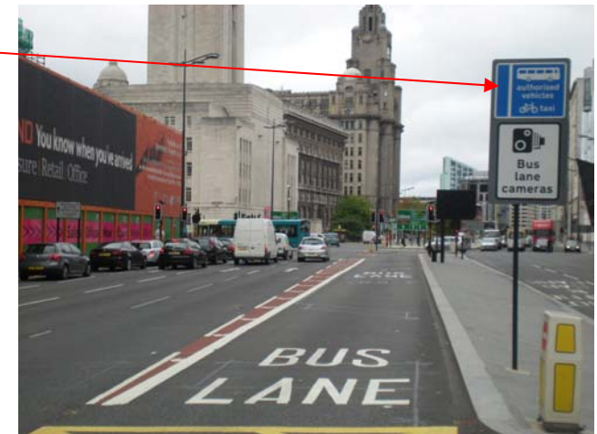
6) Strand St bus lane, second section (Sign 4)