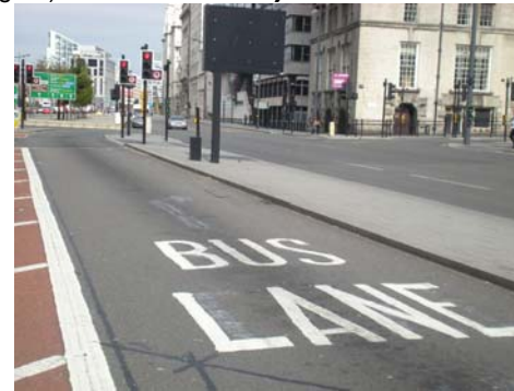
7) Strand St - end of bus lane, approach to traffic signals at James St.