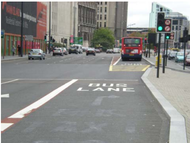
4) Strand St, end of first section of bus lane