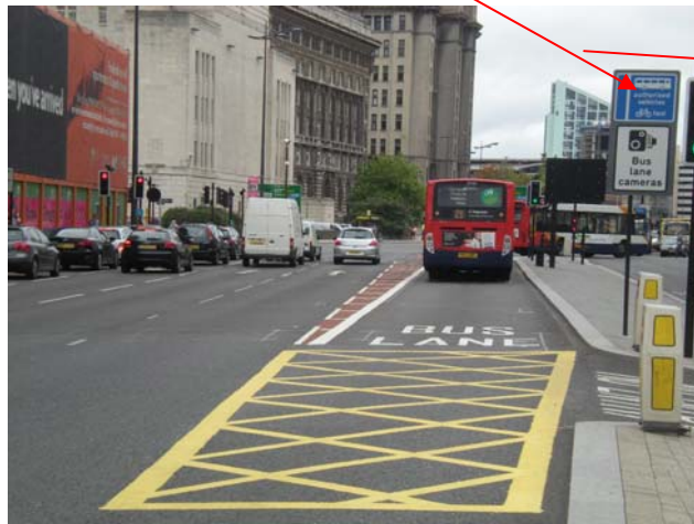
5) Intersection of Strand St bus lane (Sign 4)