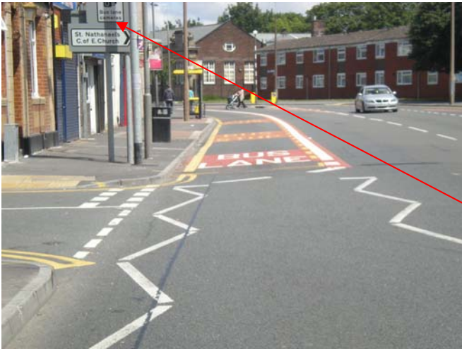
Rice Lane, at junction with Rawcliffe Rd, looking north