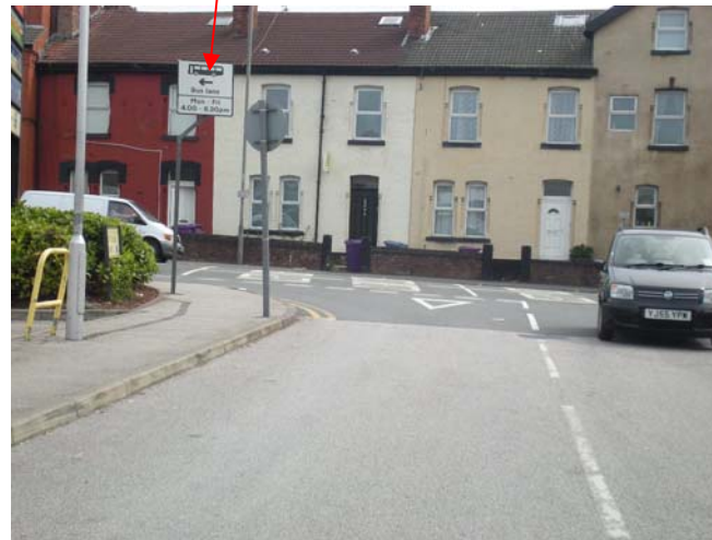
Bus Lane sign in Stoker Way (cul de sac), facing left turning traffic onto Rice Lane