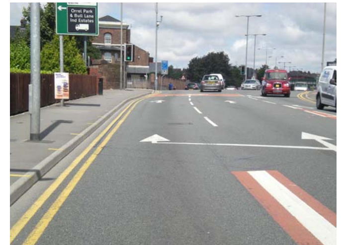
Rice Lane – end of the bus lane is 'set back' (40m long) to allow for left turning traffic to queue to access left turn into Hornby Road at signalised junction ahead.