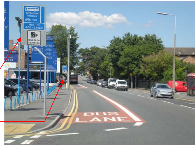
Rice Lane, at junction with Yew Tree Road, looking north