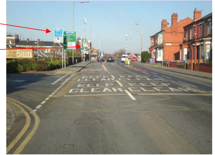
Rice Lane, at KEEP CLEAR junction with Stoker Way, looking north 10