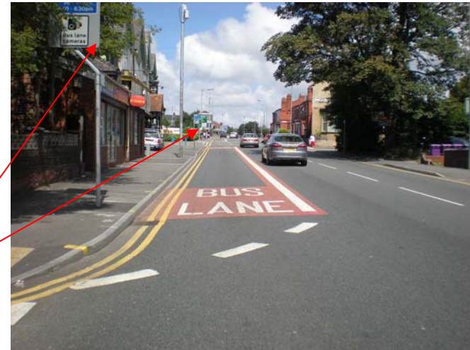
Rice Lane at junction with Walton Park, looking north