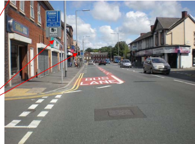
Rice Lane, at junction with Grey Road, looking north