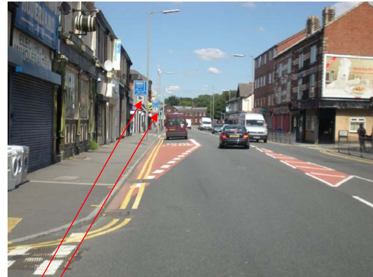
Rice Lane, just north of junction with Wellfield Rd, at commencement of bus lane entry taper