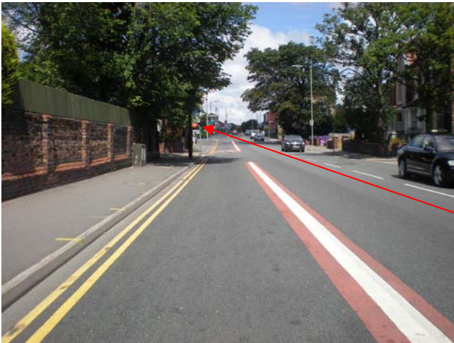
Rice Lane, adjacent Walton Park, looking north