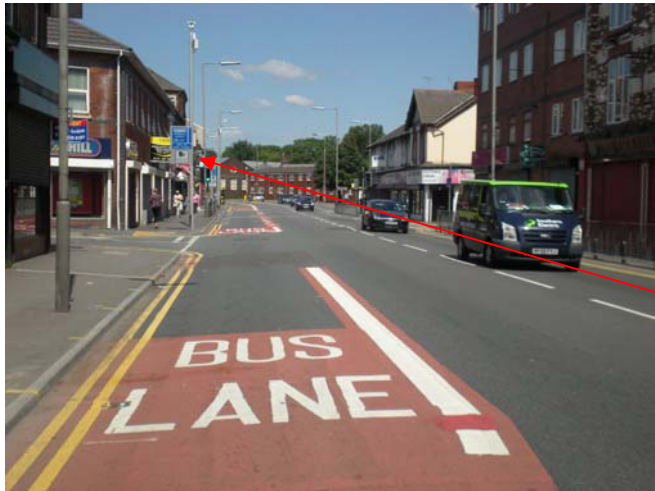
Rice Lane, looking north towards junction with Grey Road