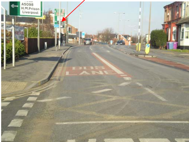
Rice Lane, just beyond KEEP CLEAR junction with Stoker Way, looking north towards 'set back' prior to Hornby Rd signalised junction.