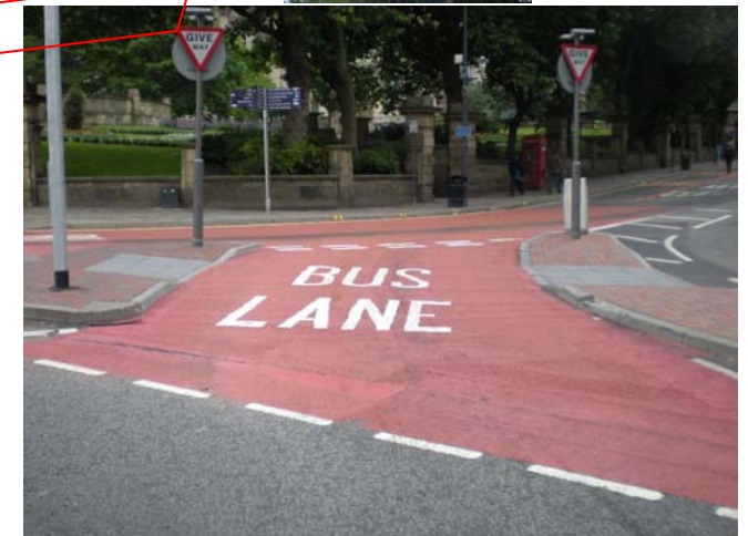
6) Section of bus lane from Old Haymarket 'intersection' leading on to St John's Lane