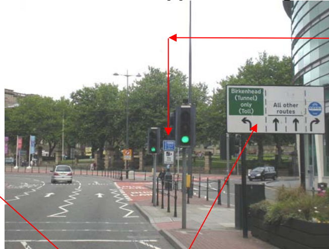
2) Victoria St approach, beyond right turning traffic filter onto Whitechapel (Signs 12, 13 & 14)