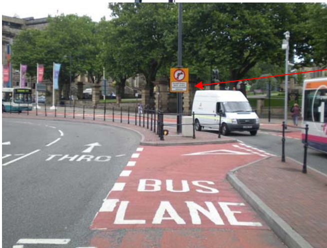
4) Bus lane junction of Victoria St, with Old Haymarket, right turn onto Old Haymarket (Sign 14)