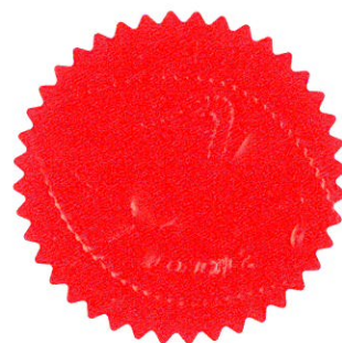
PRINCIPAL ASSISTANT CITY SOLICITOR

GIVEN under the Common Seal of the Council of the City of Liverpool this 27 day of March 2018.