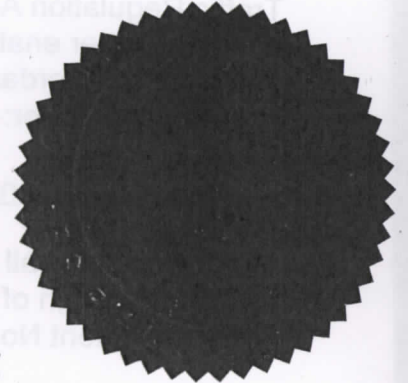
Head of Legal & Democratic Services

THE COMMON SEAL of EASTLEIGH ) BOROUGH COUNCIL was hereunto ) affixed in the presence of:- )